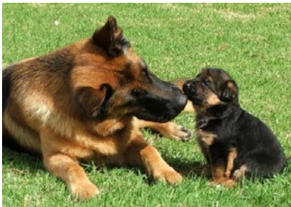
Kira as a pup with her mother